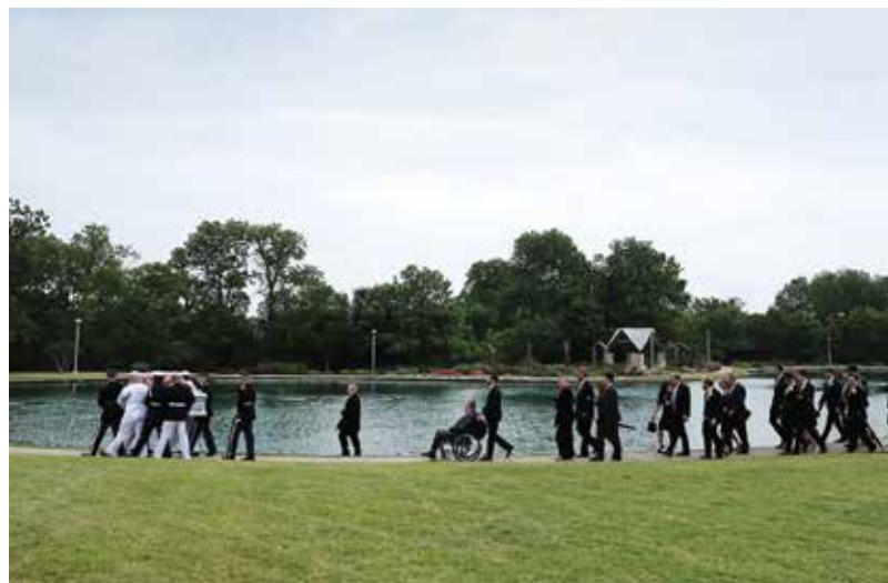
TOP: A military honor guard bears Mrs. Bush’s remains at Bush Library. MIDDLE: The Texas A&M Corps of Cadets stands at attention as the Bush family motorcade arrives at the Bush Library. BOTTOM: The Bush family proceeds to the funeral plot on the grounds of the Bush Library.