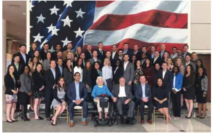
President and Mrs. Bush welcome the 2018 class of the Presidential Leadership Scholars program to the Bush Center.

Leadership Scholars (PLS) program is a joint initiative of the presidential centers of George W. Bush, William J. Clinton, George H.W. Bush, and Lyndon B. Johnson — and is designed for mid-career professionals from diverse backgrounds and who share a commitment to facing society's greatest challenges to learn more about leadership.