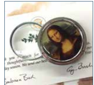
From Current Exhibits

Barbara Bush / George Bush Notebook $12.95 ea.