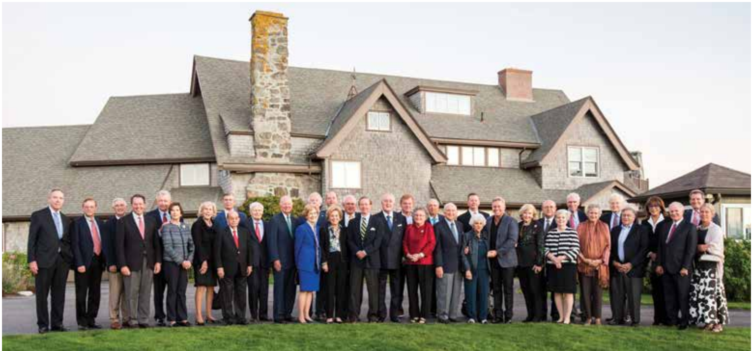
The George H.W. Bush Presidential Library Foundation's Board of Trustees gathered this September in Kennebunkport, Maine.