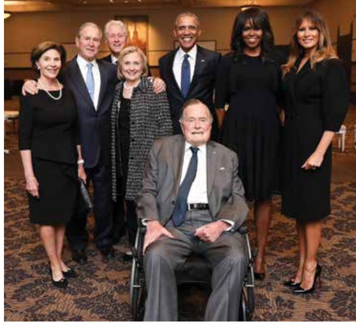
ABOVE: First Lady Melania Trump joined former President and Mrs. Obama, former President and Sec. Clinton, former President and Mrs. George W. Bush, and President Bush 41 at the pre-funeral reception.

“Bar was the gold standard of what it meant to be a friend — a friend to those she knew well, and to those she didn’t know at