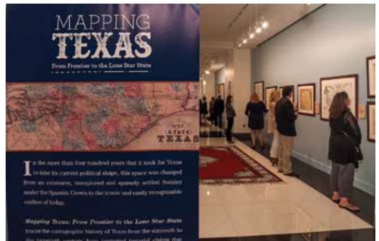
The marvelous collection of the Bush Library's "Mapping Texas" exhibit runs through January 2, 2019.

to be able to share this magnificent collection to those visiting the library that celebrates my grandfather's legacy as a Texan and the 41st President," Commissioner Bush said. The maps presented in this exhibit include Martin Waldseemüller's 1513 Tabula Terre Nove, one of the earliest maps of the Americas and Stephen F. Austin's 1837 Connected Map of Austin's Colony. Don't miss this amazing look at Texas history!