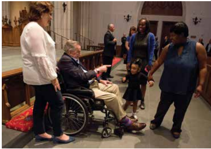
ABOVE: Former President Bush 41 and his daughter Doro greet well-wishers at St. Martin's Church on Friday April 20, 2018.

Four of the five living former presidents — Barack Obama, George W. Bush, Bill Clinton and George H.W. Bush — together with First Lady Melania Trump, former First Ladies Michelle Obama, Laura Bush and Secretary Hillary Clinton attended the funeral service on Saturday, April 21st. (President Jimmy Carter was traveling overseas,